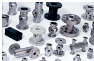
Measuring cells for any application